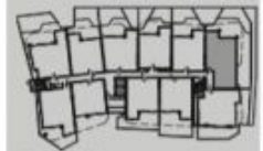
LEVEL 1 (GROUND)

ANRO GROUP - 18-12 SICKLE AVENUE MK 281 1 102@63